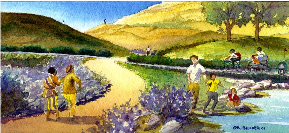
AWARD OF EXCELLENCE, ARCHITECTURE IN PERSPECTIVE 17